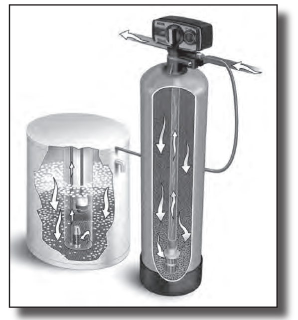
Illustration of Water Flowing Through a System

Slow rinse of the resin bed. Water flows down through the resin bed up the bottom distributor and out the drain.